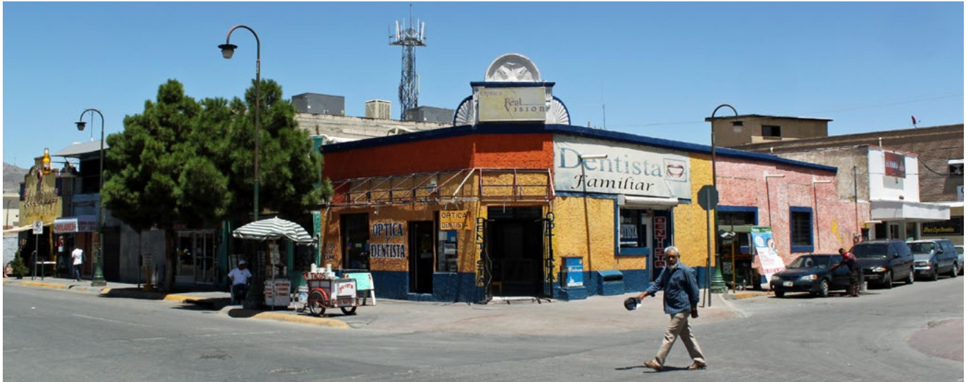
Ciudad Juárez, México.