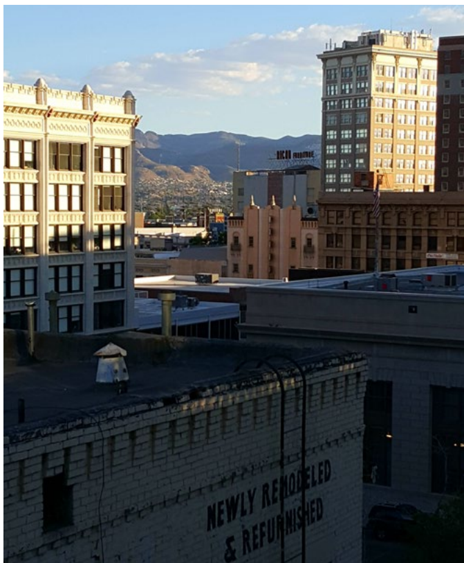
Downtown El Paso.

Background and Motivation. The workshop, Developing an Integrated Heat Health Information System for Long-Term Resilience to Climate and Weather Extremes in the El Paso-Juárez-Las Cruces Region , was held in El Paso, Texas, on July 13, 2016. Sponsored by a collaborative of universities and local and federal agencies, and planned as part of the National Integrated Heat Health Information System (NIHHIS), the workshop brought together individuals in government, practitioner, and academic communities from Mexico and the United States to discuss the intersection of the region's climate and weather with factors affecting public health risks related to extreme heat. The region is home to approximately 2.4 million people, most of whom are living in or near the urban centers of Ciudad Juárez (Chihuahua), El Paso, and Las Cruces (New Mexico). These cities share characteristics, such as a high proportion of residents of Hispanic origin, median income below the U.S. national average, and a range of climate-related environmental issues that include drought, flooding, air pollution, dust storms, and frequent occurrences of extremely high temperatures during the late spring and early summer. With hotter temperatures and more frequent and persistent heat waves projected for the El Paso-Juárez-Las Cruces region, it is critical to develop more robust systems of institutions, social learning, and partnerships to understand risks and strengthen public health resilience.