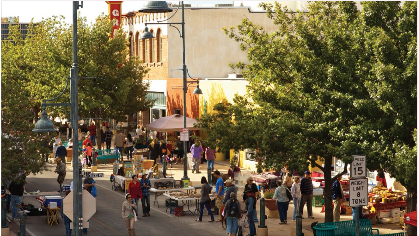
Las Cruces Farmers and Crafts Market.